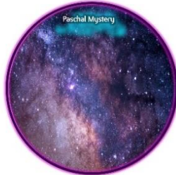
Integrative Process of Transformation

This mystery is at work in our daily living and at every level of creation. It finds its meaning in the foolish paradoxical wisdom of Jesus - that only in dying can we truly live.