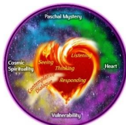
Integrative Process of Transformation