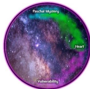
Integrative Process of Transformation