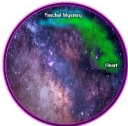
Integrative Process of Transformation

One of the most striking aspects of Our Lady of Charity of the Good Shepherd charism, is the centrality of the heart. We have already heard in our reflections on the call into the deep, Mary Euphrasia's hope and desire that you be of one heart; "a single heart" that warms and unites you all.