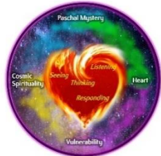
Integrative Process of Transformation