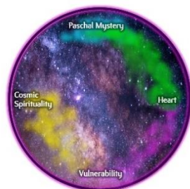
Integrative Process of Transformation

All of creation is charged with the energy and love of God, the Ever-Present Origin and source of all life. When we live from this sacred consciousness, we live from that graced place of authenticity and wholeness.