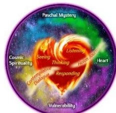
Integrative Process of Transformation