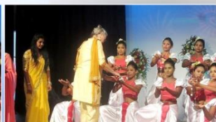
Award ceremony of the 5th and 6th batches of "Seth Sevana"