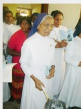
Opening and blessing of new convent building at Batagama